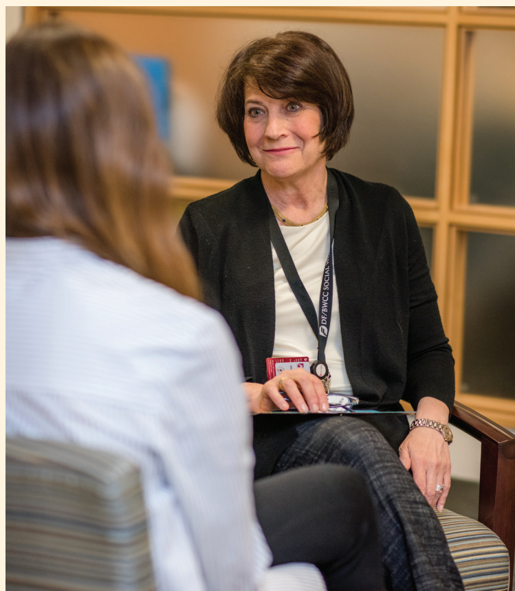
A Dana-Farber social worker meets with a young adult patient.

Please know that, even on the loneliest of days, you're never alone—there is an entire community of us young women and support is always available. To connect with any of the resources I've mentioned or to talk with someone else who has been there, call the Young & Strong Team at 617-632-3916 or email youngandstrong@partners.org .